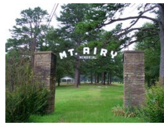
Cemetery Photo

Created by: <u>Rich Ware</u> Record added: Jan 02, 2012 Find A Grave Memorial# 82841658