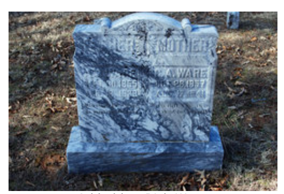
Added by: Rich Ware