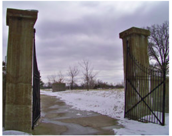
Cemetery Photo