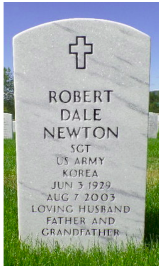
Added by: Sheila